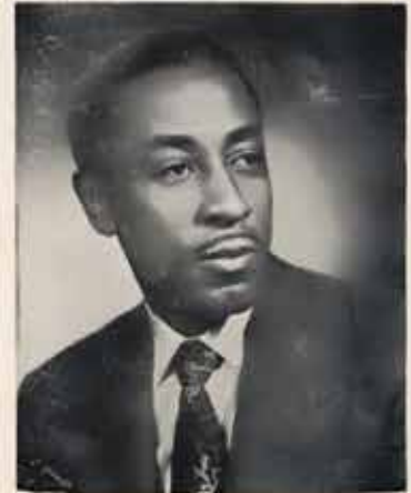
★ Robert McFerrin as “AMONASRO”